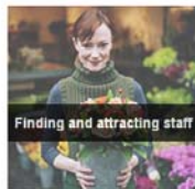
Finding and attracting staff