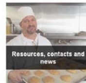
Resources, contacts and news

This website is designed to provide access to Australian Government programs and services for workforce planning, development, training, staff attraction and retention. These programs will help you get the most out of your business and your most important resource – your staff. Navigate through the options above and get connected to the Australian Government support and funding that best suits your unique business needs.