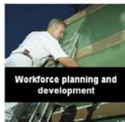
Workforce planning and development

Australian Government Skills Connect links businesses and industry to workforce development and training programs. It is a new approach by the Australian Government to integrate services that link Australian businesses and industry to programs that focus on workforce development. Whether you are looking for new staff, want to invest in up-skilling or re-skilling existing staff, or want to access assistance to help you build your business and improve productivity, Australian Government Skills Connect can help you take the first step.