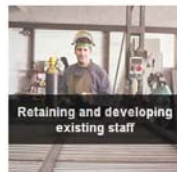
Retaining and developing existing staff